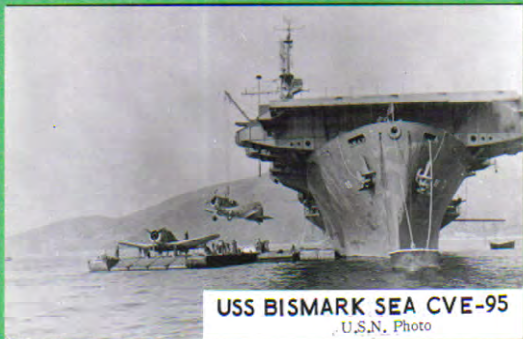
USS BISMARCK SEA CVE-95