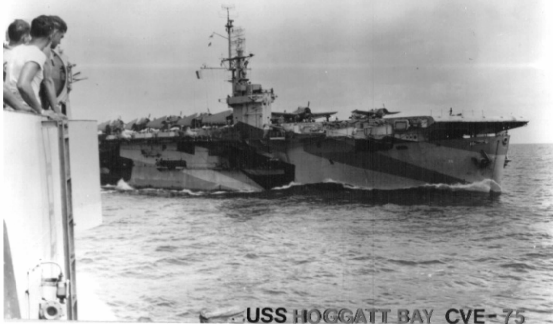
USS HOGGATT BAY CVE-75