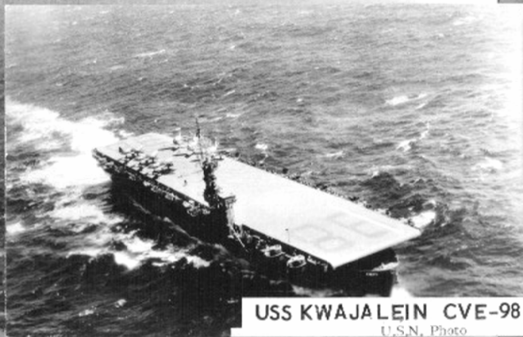
USS KWAJALEIN CVE-98