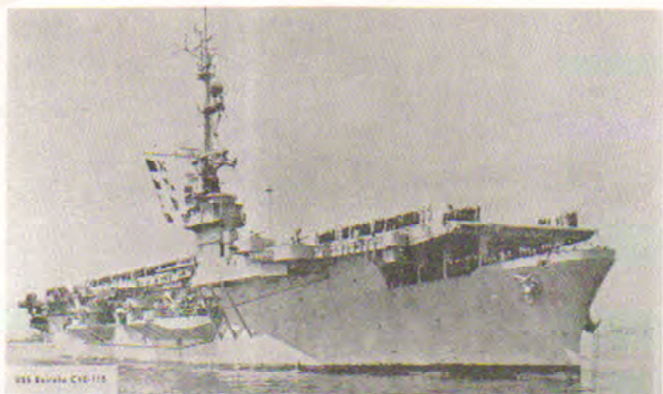
USS Bavaria (AOE-115)